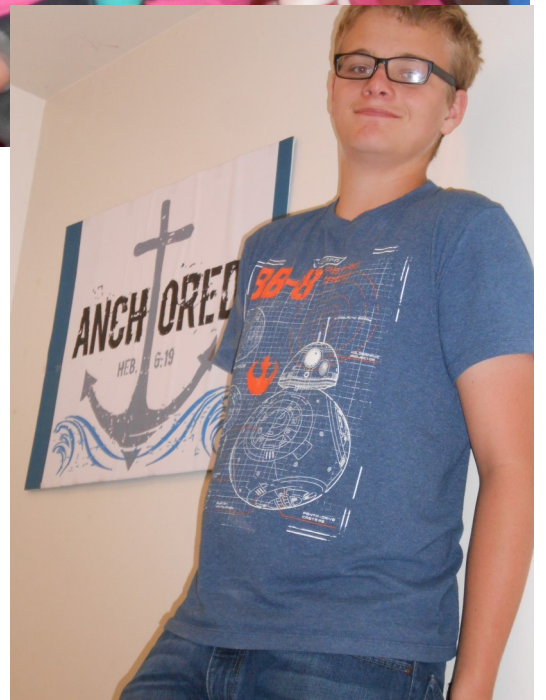
VBS 2017 "ANCHORED"