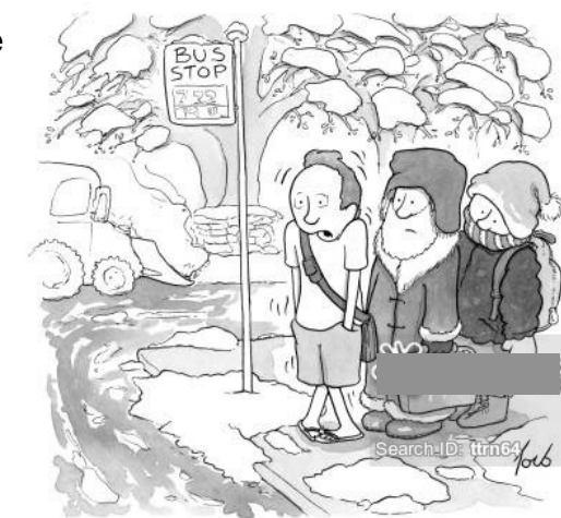
"It's spring. It's spring. It's warm. It's warm."

With that being said, starting the 15 th of May we are going to finally be starting our Bible Study on spiritual gifts. We are going to be looking at questions like; what are spiritual gifts? Do I have any? (spoiler alert; yes you do) How do I recognize my spiritual gifts, and what happens if I don't recognize them or use them? I think it will be a very informative and uplifting Bible study and I hope to see you all there.