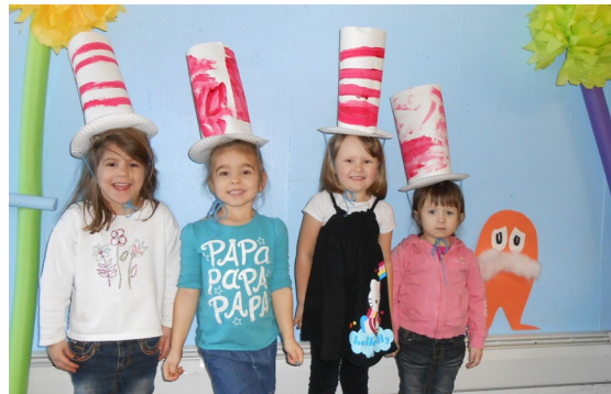
Preschool Dr. Seuss Day

Preschool year winds down with these special dates: