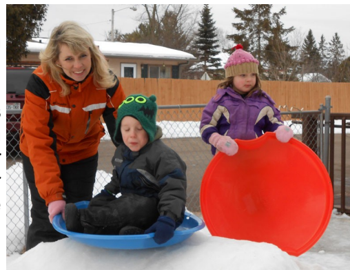
Kids had fun in the snow even during our cold winter.